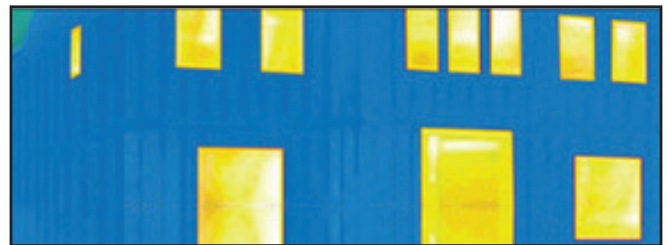
After Continuous Insulation

Adding exterior continuous insulation prevents heat flow through framing.